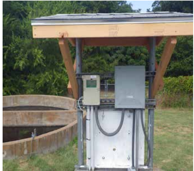
Figure 4.a.b HydroRanger 200 mounting stand and StoreIQ remote monitoring solution.

The addition of the Siemens SITRANS store IQ hardware solution and app allows the City of Decatur immediate access to the flow rate, totalizer and head measurement on their smart phone, tablet or from their computer. Alarms alert the customer when the head value falls below a specified alarm level, warning them if there is a problem upstream of the effluent basin and providing high-level alarms if the head value rises above a specified alarm level. This provides peace of mind that the plant is monitored, and personnel can respond to emergencies when they happen, even if they are not at the plant.