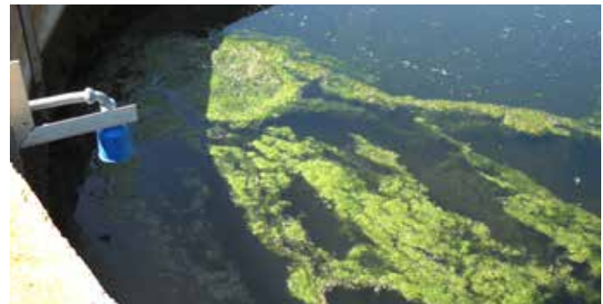
Figure 3.a.b.c. Effluent discharge basin V-notch weir for discharge flow measurement and Echomax transducer for level measurement. Note the algae buildup.

deploy SITRANS store IQ. Deploying this digital application included the development of a comprehensive solution to provide remote monitoring of the instruments and equipment at the customer's site and in accordance with their specific needs. The customer had located the HydroRanger 200 20 to 30 yards from the effluent treatment basin, and this included the availability of 120Vac. The mounting position of the HydroRanger 200 was perfect for the installation of the SITRANS store IQ solution.