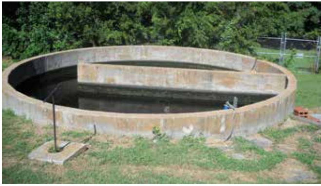
Figure 2. Effluent discharge basin and inlet underground valve handle located in line from the polishing pond

The City of Decatur was already using a HydroRanger 200 with Echomax transducer to monitor the effluent flow from the wastewater treatment plant and record the effluent basin level. The HydroRanger data was recorded so the staff would be aware of any changes that could indicate the potential of a blockage or loss of flow. It's also worth noting that the HydroRanger 200 was not connected to any SCADA and, as such, required a physical visit to manually read the totalizer and other process information from this instrument. These values were read daily for reporting purposes.